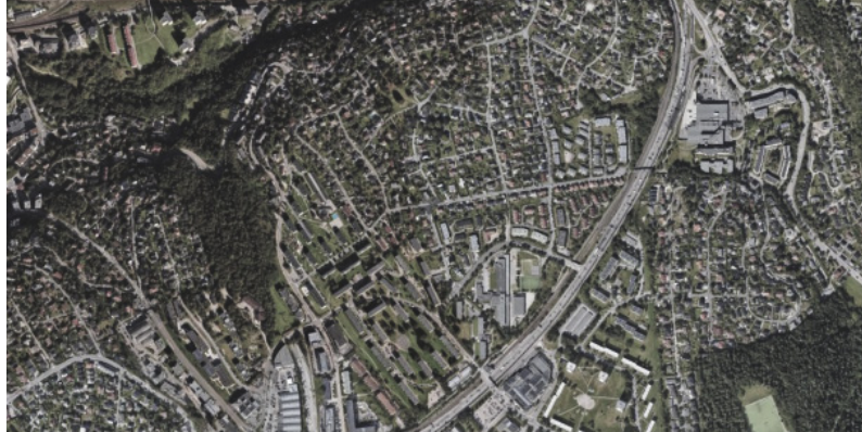
ØSTENSJØVANNET | MANGLERUD | ALNÆLVA