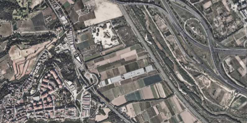
SANTA COLOMA DE CERVELLO | RIERA DE CAN JULIA