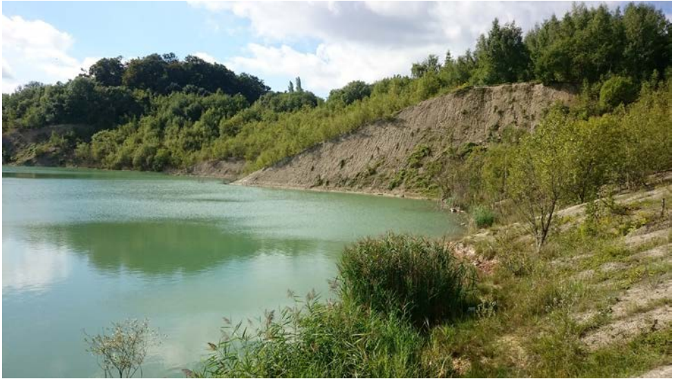
↑ Anthropogenic influences forming the landscapes in the Wild East of Hanover