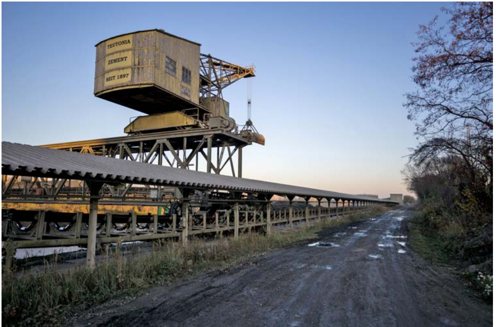
↓ Many artefacts can be discovered within Misburg